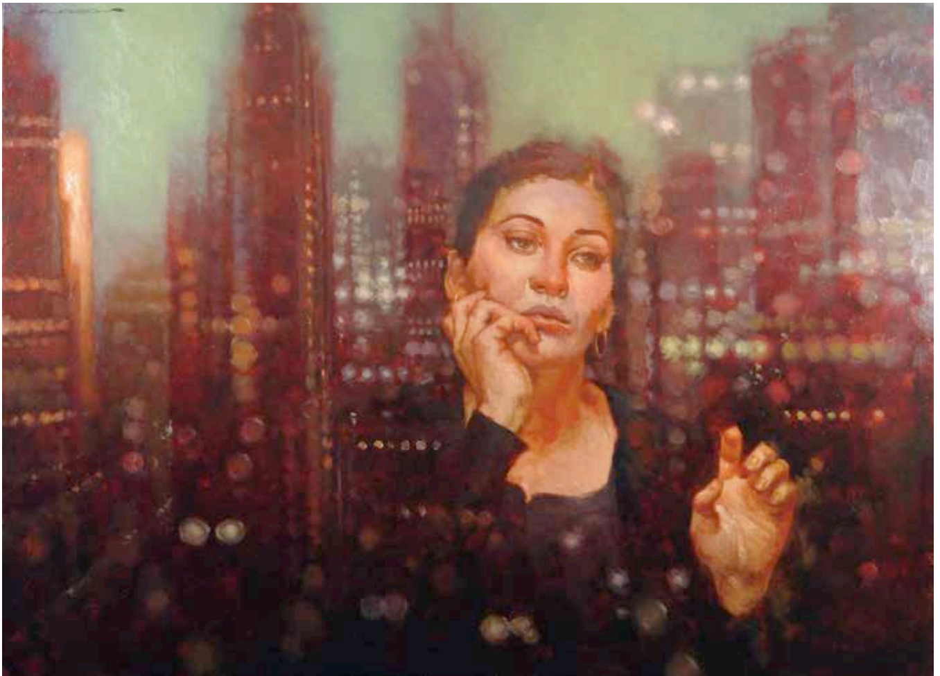
4 City Lights, oil on panel, 16 x 22"