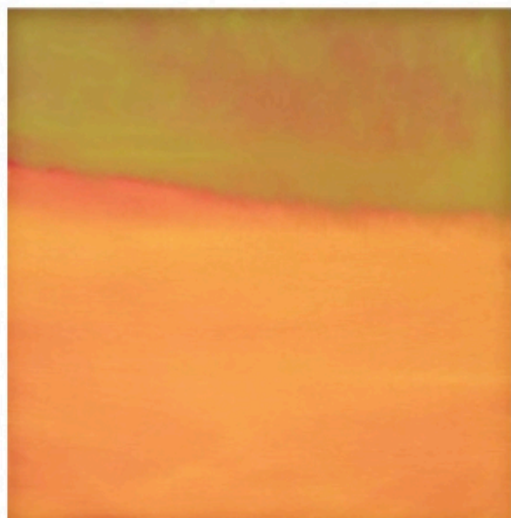
4 Burning Daylight , oil, 30 x 30"