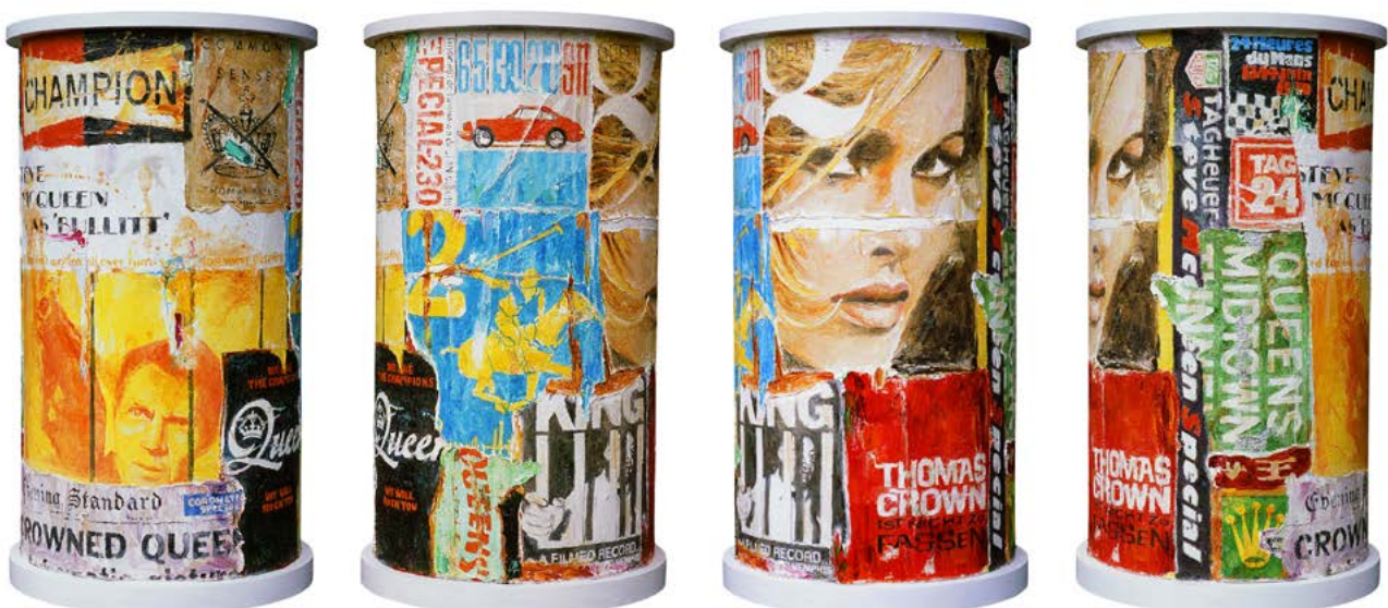
Queen SÄULE, 2023, Oil/Collage auf Leinwand/Holz, 80 cm x 40 cm Diameter

The German Bundestag (Parliament) has just bought one of my pillars for their art collection.